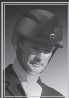
DEFENDER $229.95 - $279.95