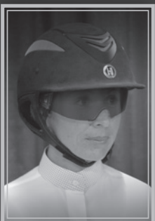
DEFENDER PRO $279.95 - $329.95